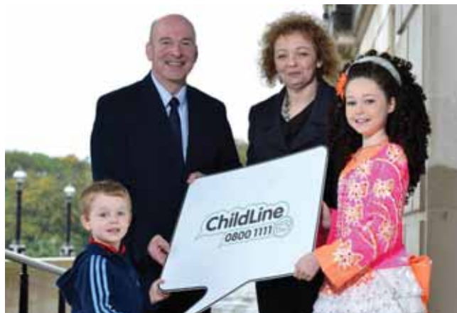
The Minister for Arts, Culture and Leisure, Carál Ní Chuilín MLA encouraging organisations to support ChildLine.

The team worked in collaboration with young people and sports coaches, clubs and organisations to develop a toolkit focusing on promoting positive parental behavior in sport. As part of this campaign, they produced a range of useful materials and launched the 'Magic Sports Kit DVD' which identifies how to avoid, reduce or deal with incidents of poor parental behavior in sport and encourages a child-focused approach in sport.