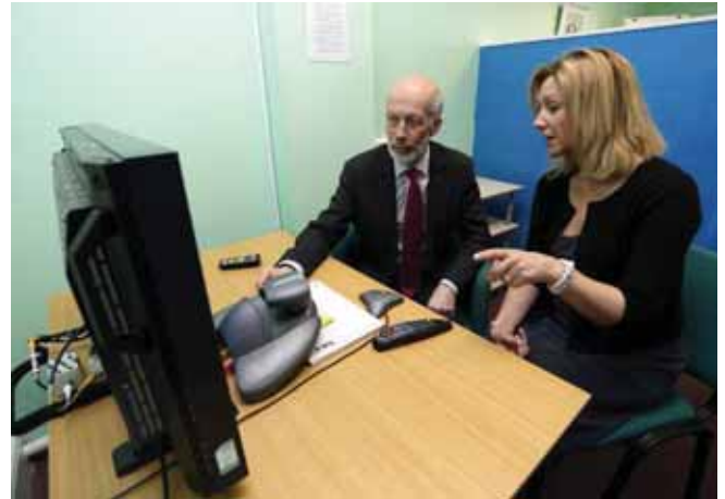
Minister of Justice David Ford MLA

The Young Witness Service is established as a key voice and source of information on issues relating to the treatment and experience of young witnesses. The team has been busy delivering training on the specialist needs of child witnesses to the Public Protection Service, Registered Intermediaries, PSNI and the Institute of Professional Legal Studies in Queens University Belfast. We hope to expand our multi-agency relationships to help them protect children more effectively.