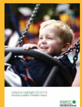
Helpline Highlight 2012/13 Presented by NSPCC Northern Ireland

We also published the second annual 'Helpline Highlight' report which details management information on helpline calls from Northern Ireland. The report explores the impact of the work of our helpline throughout 2012/13 and the role it has played in the wider child protection system to keep children safe.