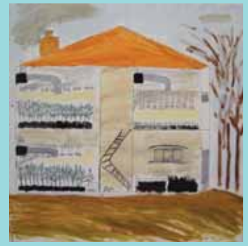
Artwork from CTAC's young people's advisory group)

CTAC continues to have an increasing presence in Northern Ireland and has a key role to play in ensuring that the agencies within the community they serve work together to protect trafficked children.