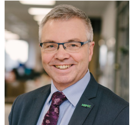
Peter Wanless Chief Executive of the NSPCC

“If we all come together now, we can make a difference. We have an important responsibility as the NSPCC to rally people together and make the biggest impact we can to stop child abuse and neglect.”